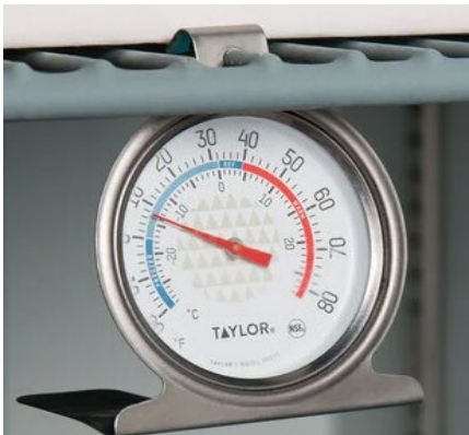
Refrigerator thermometer example