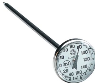
Stem thermometer examples